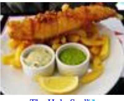
The Holy See" (The Vatican)