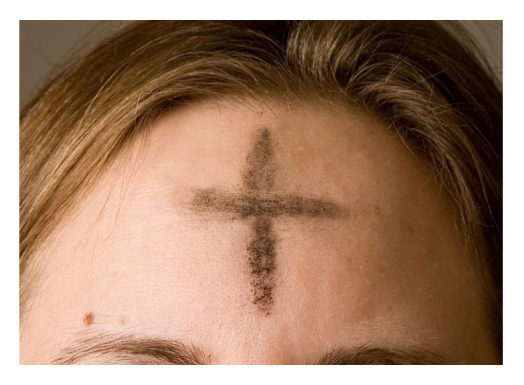
A cross marked in ash on a worshipper's forehead -- <u>Ash Wednesday</u> -- <u>Wikipedia</u>

Ash Wednesday: <u>Lenten Food Regulations</u> begin for Roman Catholics and others