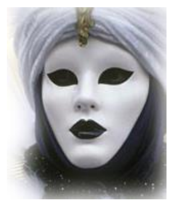
Lady in White Carnival of Venice - Wikipedia Italy

--<u>Shauna Beni</u>, <u>Megan Spurrell</u> and <u>Paul Rubio</u>, <u>Conde Nast Traveler</u> (31 January 2020)